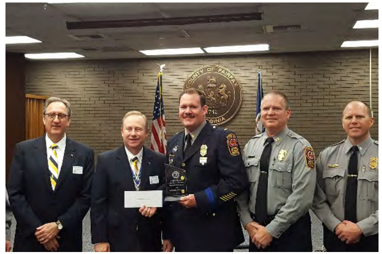
LAW ENFORCEMENT AWARD - April 6, 2017