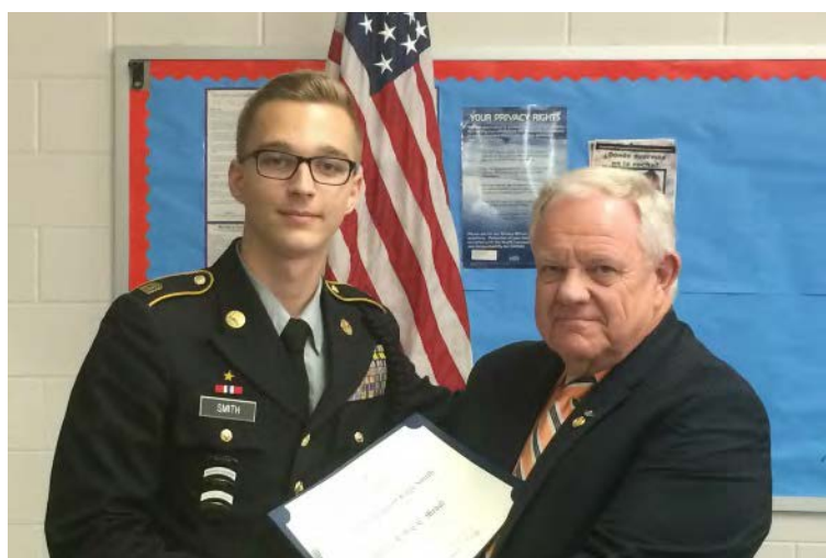
JROTC AWARD - May 18, 2017