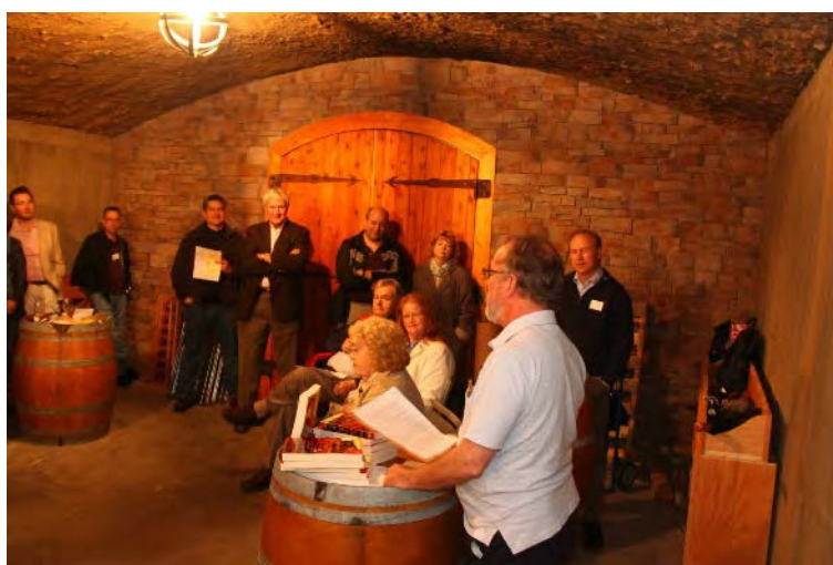
CHRYSALIS WINERY - April 22, 2017