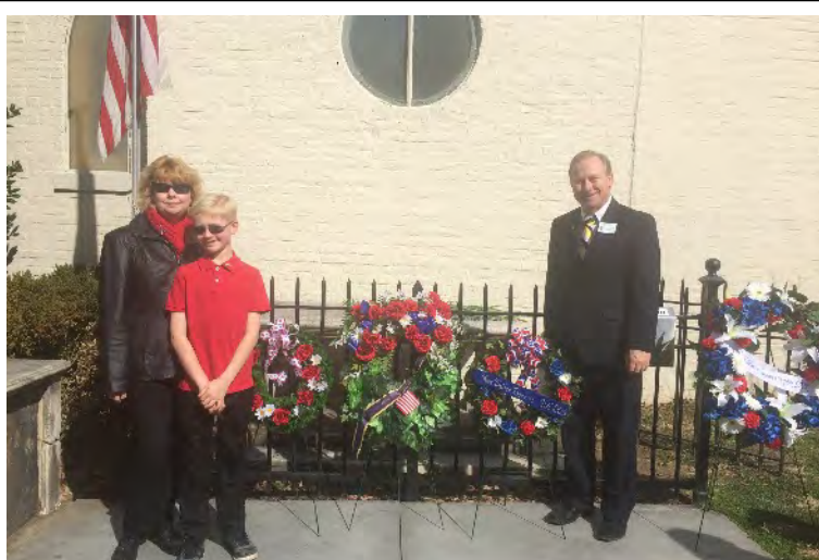
GEORGE WASHINGTON'S BIRTHDAY - February 20, 2017