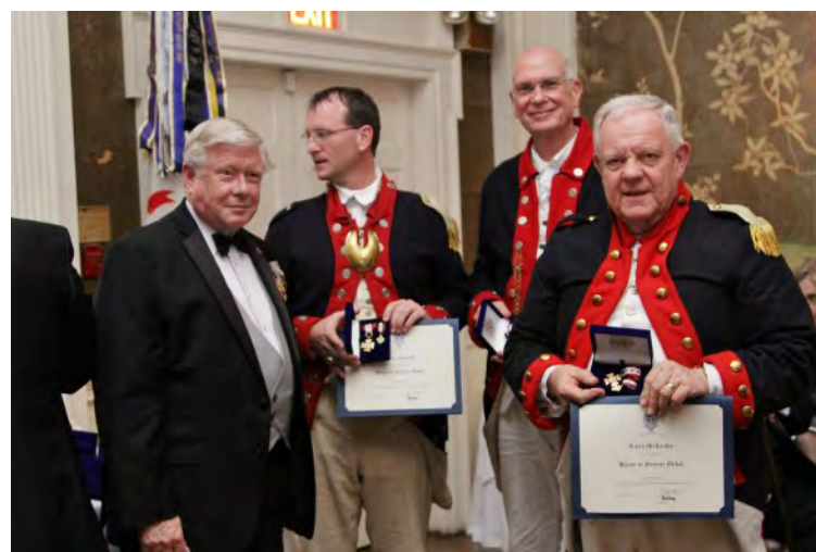
HONOR IN SERVICE AWARDS - April 25, 2017