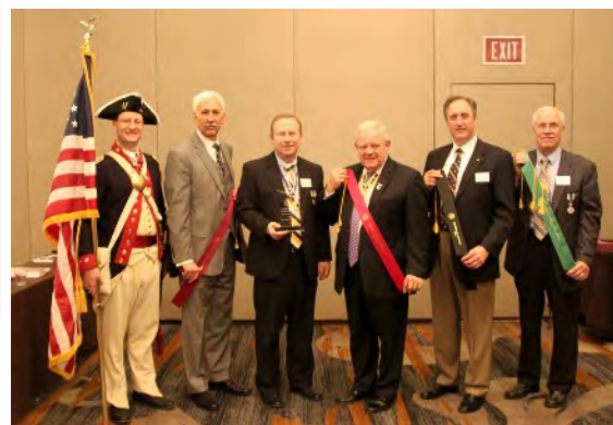
Members of the chapter display some of the awards at the business meeting