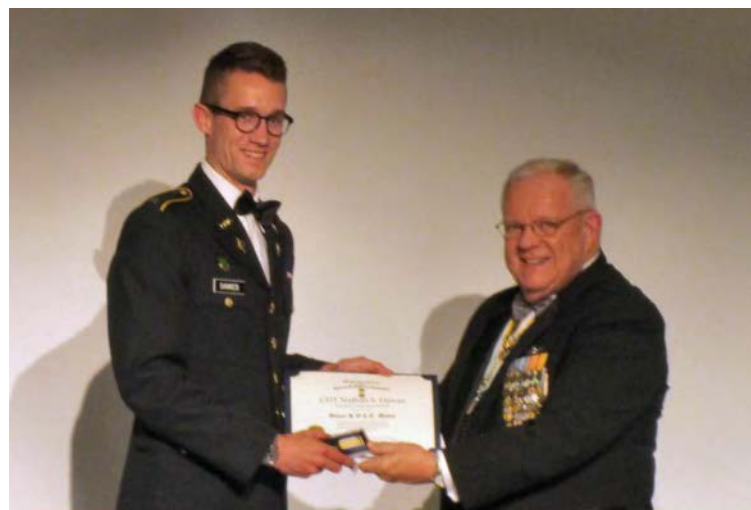
ROTC AWARD - April 15, 2017