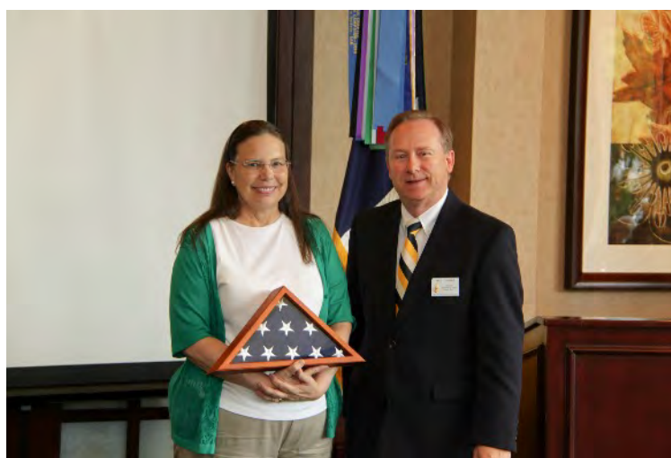
INTERNATIONAL COUNTRY CLUB - May 20, 2017