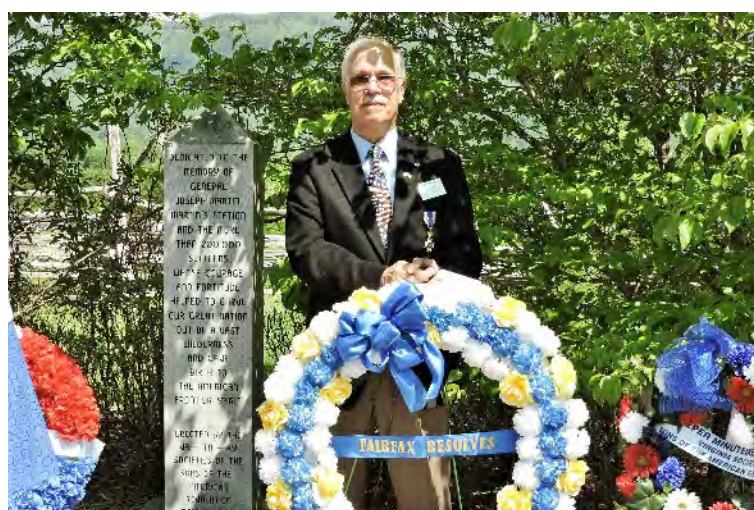
RAID AT MARTIN'S STATION - May 10, 2017