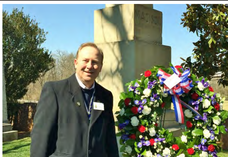
JAMES MADISON'S BIRTHDAY - March 16, 2017