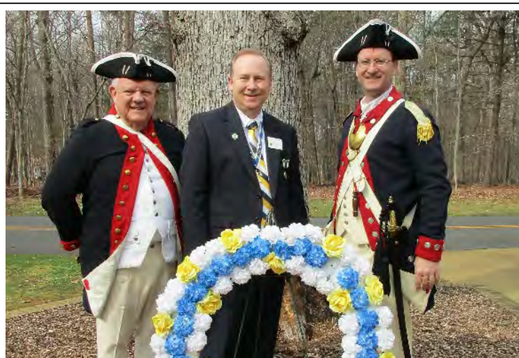
BATTLE OF GUILFORD COURTHOUSE - March 18, 2017