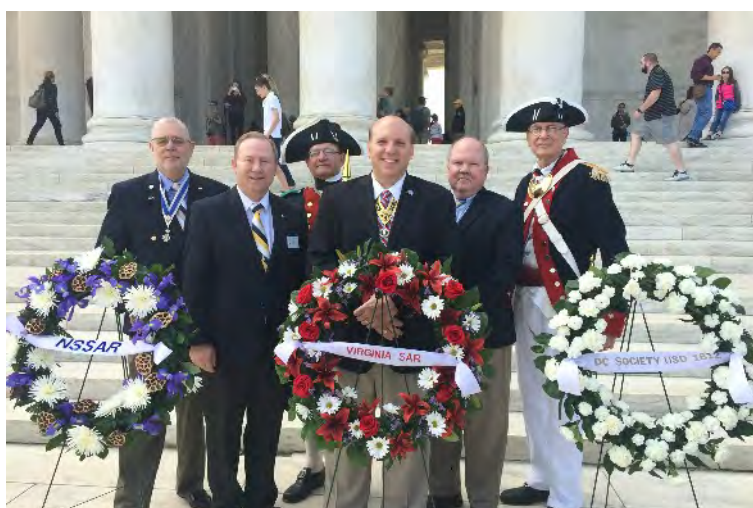
THOMAS JEFFERSON'S BIRTHDAY - April 13, 2017