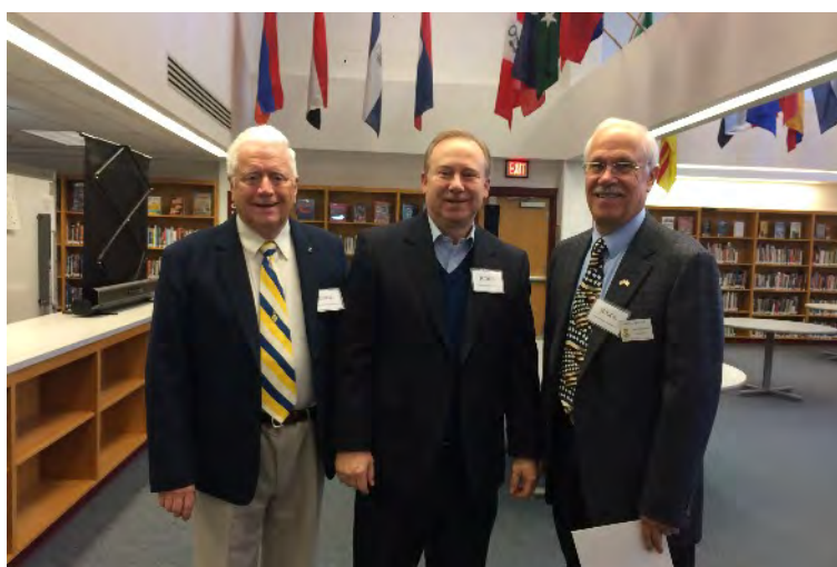
HISTORY DAY AWARDS - March 4, 2017