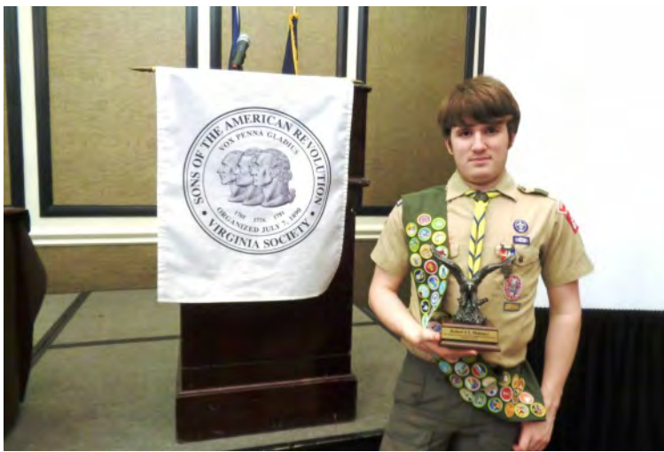
EAGLE SCOUT AWARD - February 11, 2017