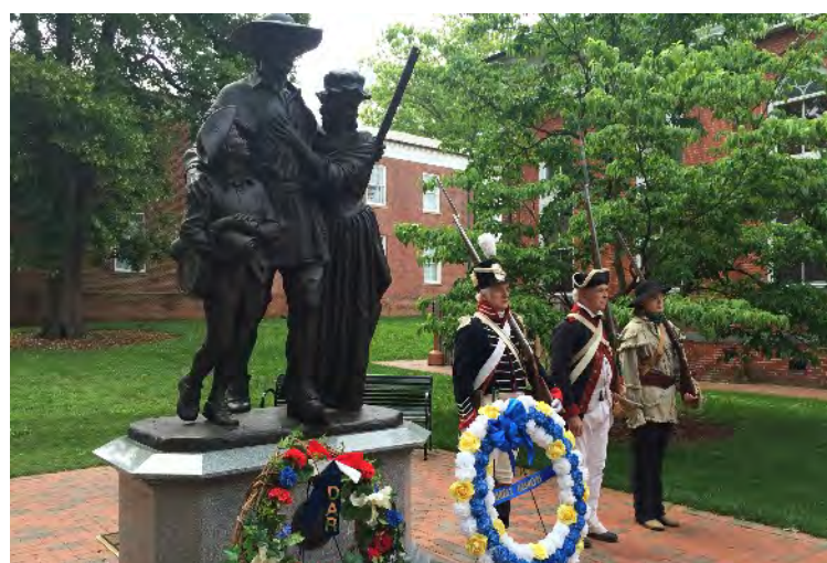
MEMORIAL DAY - May 29, 2017