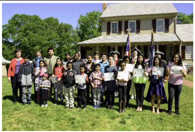
CHILDREN'S CITIZENSHIP CEREMONY - May 9, 2017