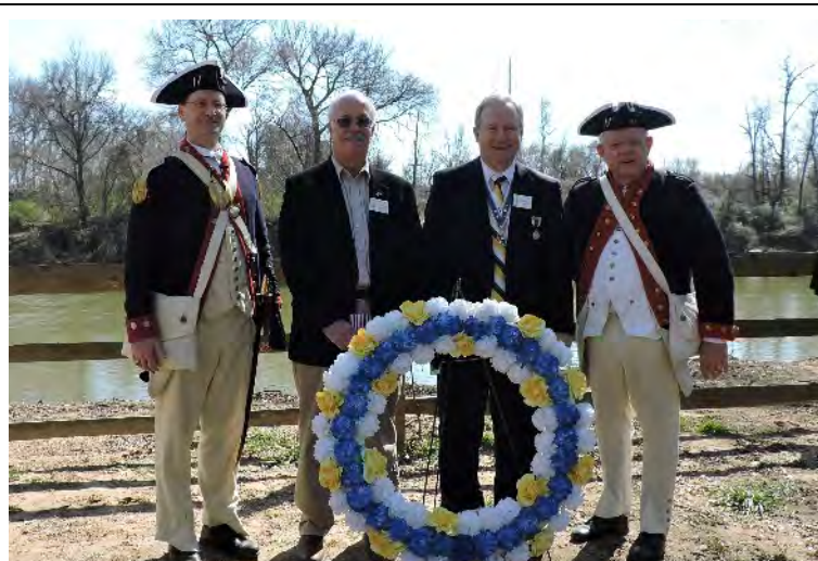
CROSSING OF THE DAN - February 18, 2017