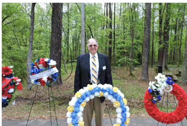
JAMES MONROE'S BIRTHDAY - April 29, 2017